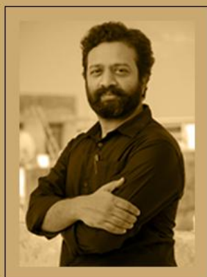
Founder of Mill Power Pvt. Ltd.